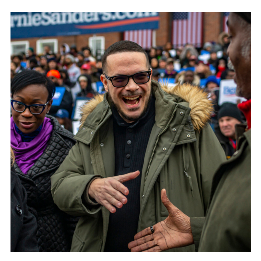
Shaun King campaigns for Senator Bernie Sanders in 2019.